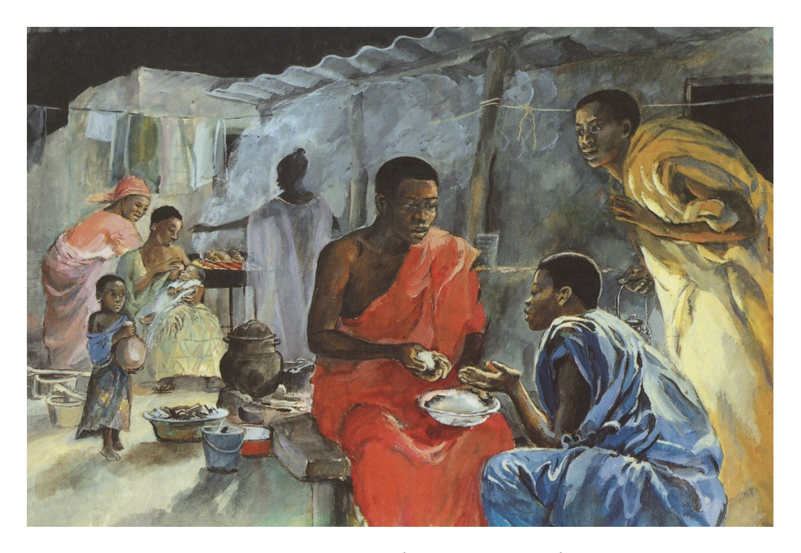
Jesus appears on the Emmaus Road From the series, "The Life of Jesus Mafa", Northern Cameroon Two images of transfiguration and transformation.