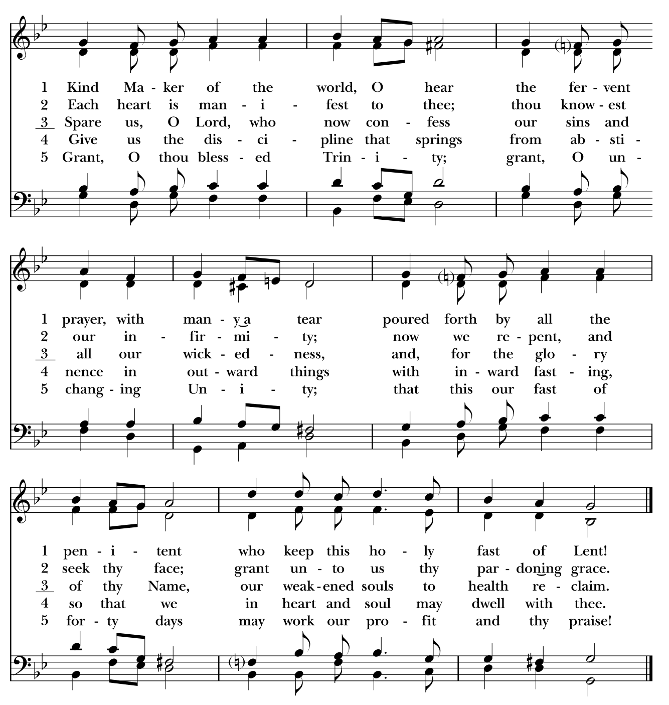
Words: St. Gregory the Great (540-604); ver. Hymnal 1940 , alt. Copyright © The Church Pension Fund. Music: A la venue de Noël , melody from Fleurs des noëls , 1535.