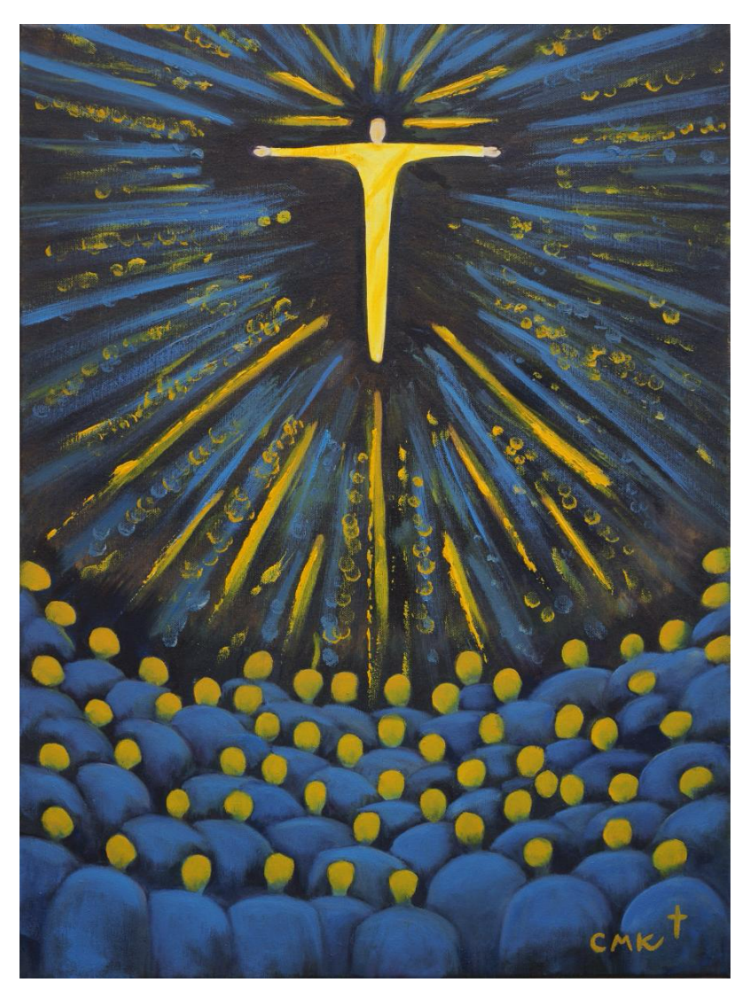
Light of the World. Art4prayer.co.uk