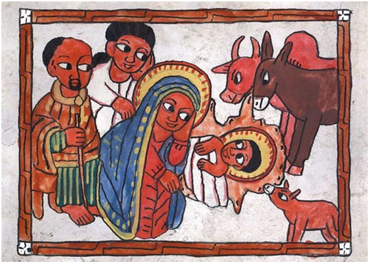
Contemporary Ethiopian Nativity Icon