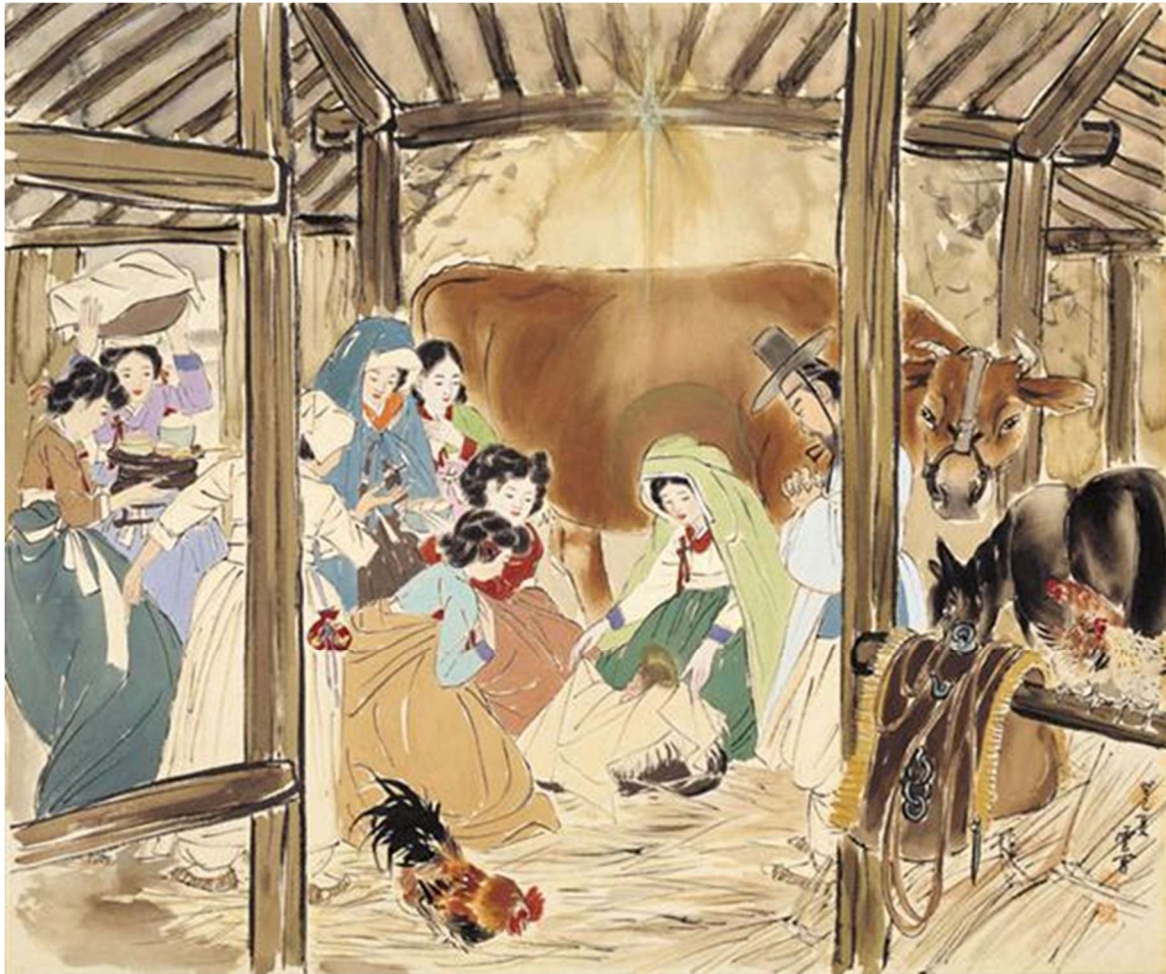
The Birth of Jesus Christ, Woonbo Kim Ki-chang, 1952-53.

For unto us a son is born, unto us a son is given: and the government shall be upon his shoulder: and his name shall be called Wonderful, Counsellor, The mighty God, The everlasting Father, The Prince of Peace.