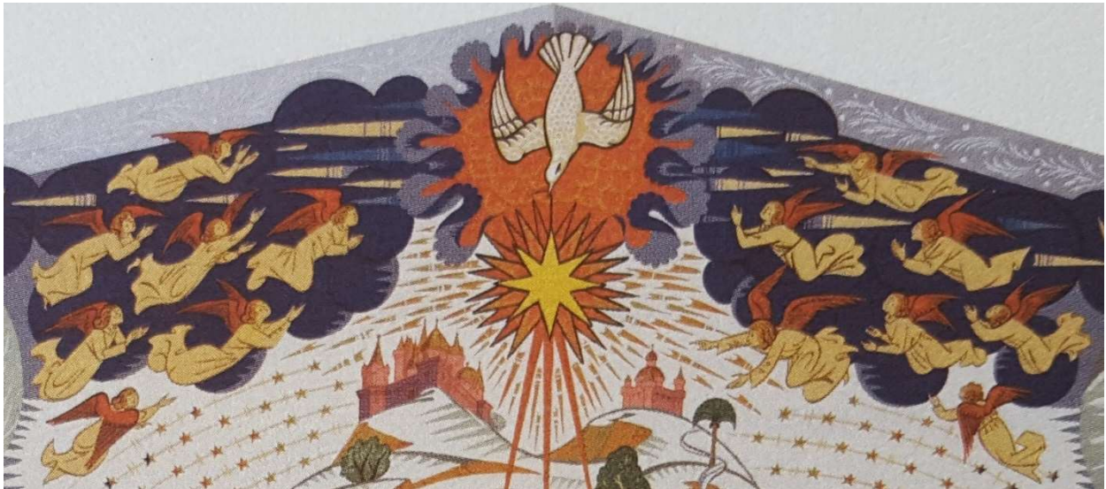
Christmas Radiance (detail).

Christ the sun of righteousness shine upon you, scatter the darkness from before your path, and make you ready to meet him when he comes in glory; and the blessing of God Almighty, the Father, the Son, and the Holy Spirit be with you now and always. Amen.